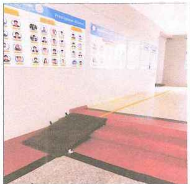
Ramp - Ground Floor towards Civil Engineering Department