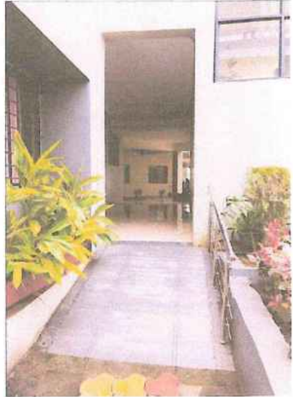
Steel Railing – Near Mechanical Engineering Department