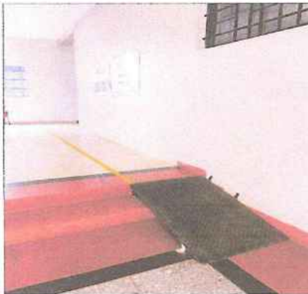
Ramp – Ground Floor towards Mechanical Engineering Department