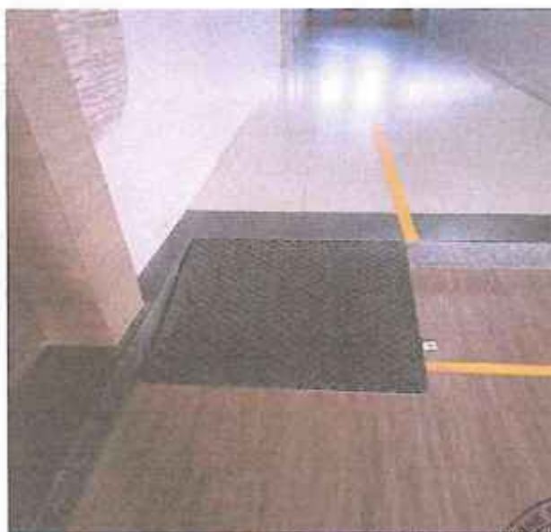
Ramp – Near Director Cabin