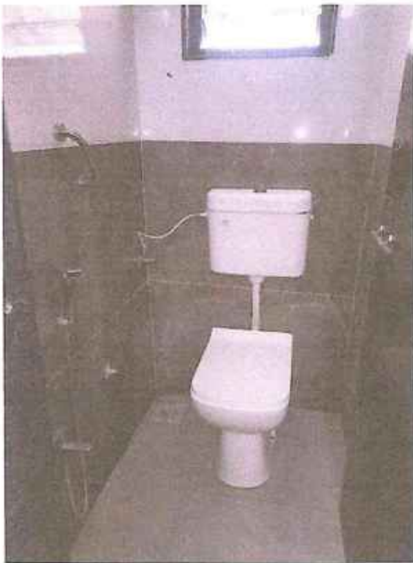
Disabled Gents Toilet Grab Rails – Near Office