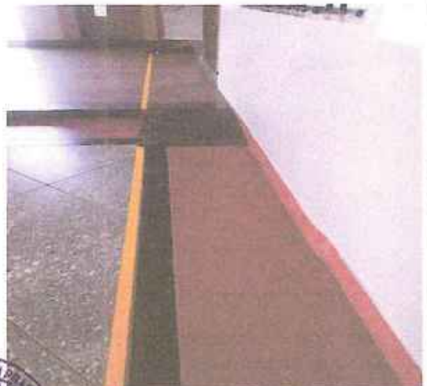
Ramp – Near Administrative Office